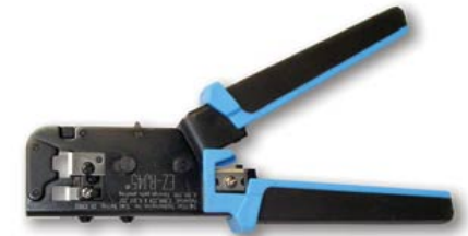
BD45000 Crimp & Trim Tool